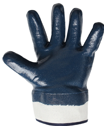
Heavy-Duty Industrial Gloves