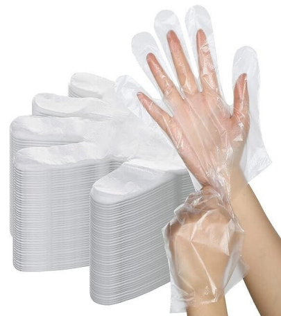
Food-Grade Disposable Gloves