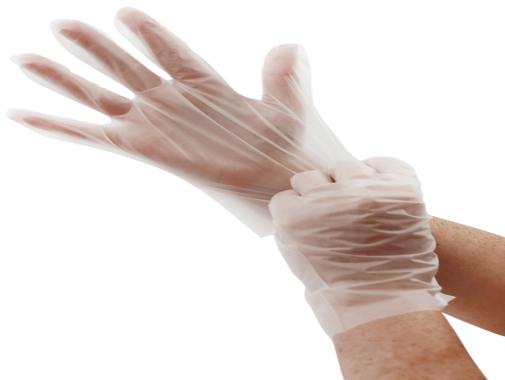
Transparent PE/TPE Gloves